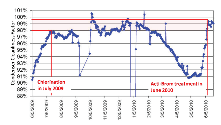
Figure 2 - The 2009 condenser chlorination program returned the condenser to 98% cleanliness factor. In 2010, using ACTI-BROM, condenser cleanliness factor reached 99.5%. The improvement delivered $600,00 in annual economic recovery.

A 1.5% improvement in condenser cleanliness factor delivers a capacity increase of about 9 MW, an improvement that represents a $600,000 annual economic recovery. The plant was able to achieve these financial results while reducing total residual oxidant discharges to Lake Ontario by 50% and meet its newer, more restrictive discharge limits.