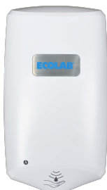
Classic and Compact Touch-Free Dispensers