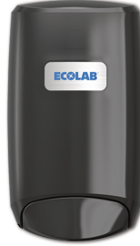
Classic and Compact Manual Dispensers