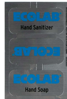
Product Category Badges

TO LEARN MORE CALL 800.352.5326 OR VISIT ECOLAB.COM